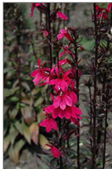
Starship Deep Rose Lobelia flowers

Starship Deep Rose Lobelia is recommended for the following landscape applications;