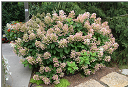
Little Quick Fire Hydrangea in bloom