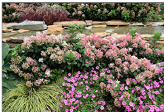
Little Quick Fire Hydrangea in bloom

Little Quick Fire Hydrangea makes a fine choice for the outdoor landscape, but it is also well-suited for use in outdoor pots and containers. With its upright habit of growth, it is best suited for use as a 'thriller' in the 'spiller-thriller-filler' container combination; plant it near the center of the pot, surrounded by smaller plants and those that spill over the edges. It is even sizeable enough that it can be grown alone in a suitable container. Note that when grown in a container, it may not perform exactly as indicated on the tag - this is to be expected. Also note that when growing plants in outdoor containers and baskets, they may require more frequent waterings than they would in the yard or garden.