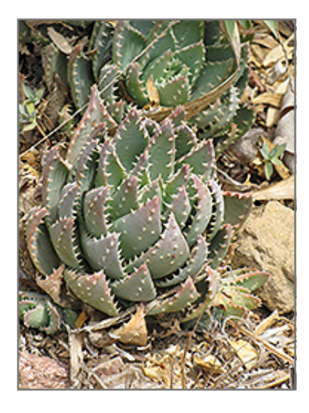
Short-leaved Aloe

Short-leaved Aloe is recommended for the following landscape applications;