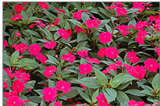
Bounce Cherry Impatiens in bloom