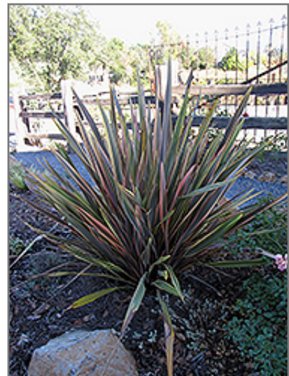
Rainbow Sunrise New Zealand Flax