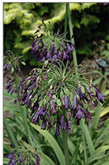
Black Drooping Lily-Of-The-Nile flowers

Black Drooping Lily-Of-The-Nile is recommended for the following landscape applications;