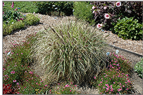
Ginger Love Fountain Grass