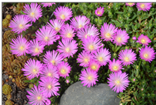
Table Mountain Ice Plant flowers

Table Mountain Ice Plant is recommended for the following landscape applications;