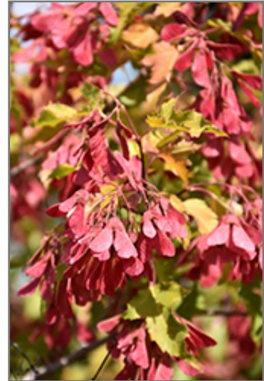
Amur Maple (tree form) fruit

This tree does best in full sun to partial shade. It is very adaptable to both dry and moist locations, and should do just fine under average home landscape conditions. It may require supplemental watering during periods of drought or extended heat. It is not particular as to soil type or pH. It is highly tolerant of urban pollution and will even thrive in inner city environments. Consider applying a thick mulch around the root zone in both summer and winter to conserve soil moisture and protect it in exposed locations or colder microclimates. This is a selected variety of a species not originally from North America.