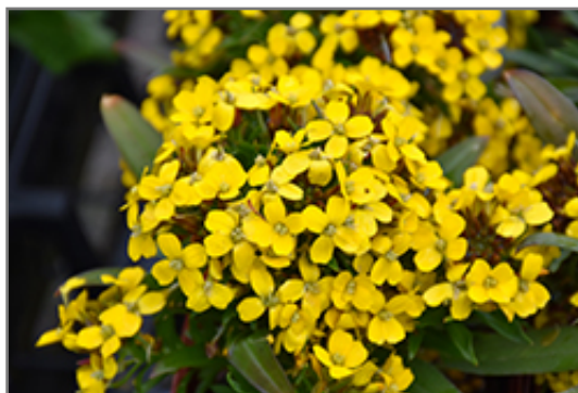
Canaries Wallflower flowers

Canaries Wallflower is recommended for the following landscape applications;