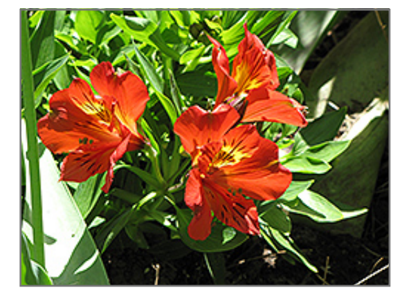
Princess Victoria Alstroemeria flowers

1100 W. Moana Lane Reno, NV 89509 (775) 825-0600 (775) 825-0602 - Corporate Office