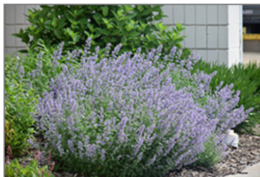
Cat's Meow Catmint in bloom