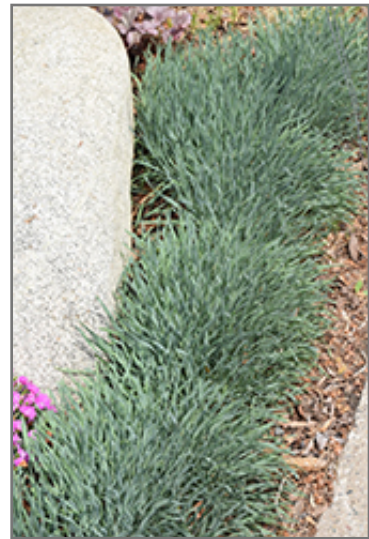
Blue Eddy Ornamental Onion