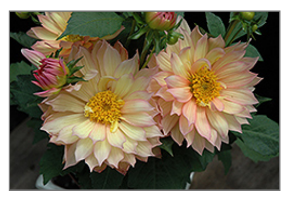
Gallery Pablo Dahlia flowers

Gallery Pablo Dahlia features showy lightly-scented salmon daisy flowers with yellow eyes at the ends of the stems from mid to late summer, which emerge from distinctive rose flower buds. The flowers are excellent for cutting. Its serrated pointy leaves remain green in color throughout the season.