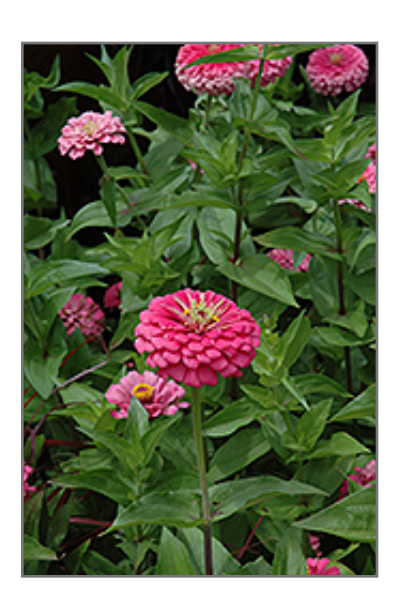
Miss Willmott Zinnia flowers

Miss Willmott Zinnia will grow to be about 32 inches tall at maturity, with a spread of 24 inches. When grown in masses or used as a bedding plant, individual plants should be spaced approximately 18 inches apart. Its foliage tends to remain dense right to the ground, not requiring facer plants in front. This fast-growing annual will normally live for one full growing season, needing replacement the following year.