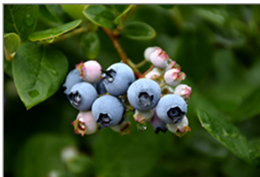
Elliott Blueberry fruit

Elliott Blueberry features dainty clusters of white bell-shaped flowers with shell pink overtones hanging below the branches in mid spring. It has green deciduous foliage. The glossy oval leaves turn yellow in fall. It features an abundance of magnificent blue berries from late summer to early fall. The smooth brick red bark adds an interesting dimension to the landscape.