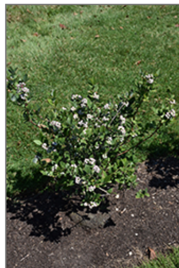
Elliott Blueberry fruit