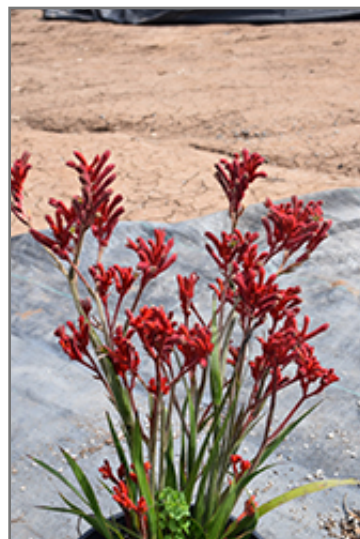
Kanga Red Kangaroo Paw in bloom