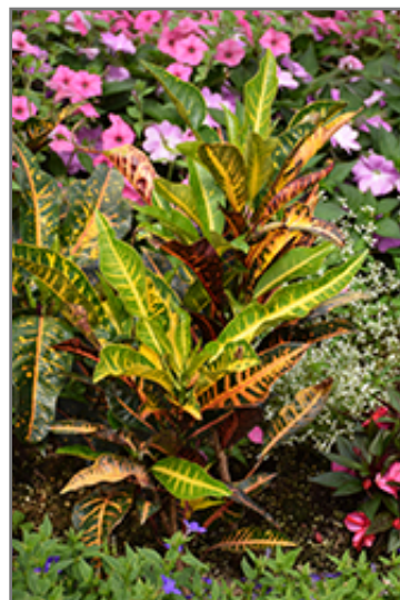
Variegated Croton

This is a dense herbaceous evergreen houseplant with an upright spreading habit of growth. Its wonderfully bold, coarse texture is quite ornamental and should be used to full effect. This plant should not require much pruning, except when necessary to keep it looking its best.