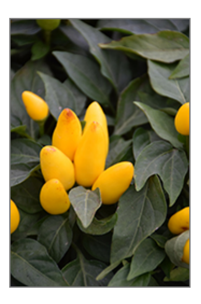
Salsa Yellow Ornamental Pepper fruit

Salsa Yellow Ornamental Pepper is an herbaceous annual with an upright spreading habit of growth. Its medium texture blends into the garden, but can always be balanced by a couple of finer or coarser plants for an effective composition.