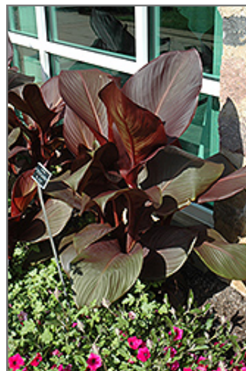
Tropicanna Black Canna

This plant is native to the tropics and prefers growing in moist environments with evenly warm conditions all year round. In our climate, it is usually grown as an outdoor annual in the garden or in a container. If you want it to survive the winter, it can be brought in to the house and provided with special care, and then returned to the garden the following season. In its preferred tropical habitat, it can grow to be around 5 feet tall at maturity, with a spread of 24 inches. However, when grown as an annual or when overwintered indoors, it can be expected to perform differently, and its exact height and spread will depend on many factors; you may wish to consult with our experts as to how it might perform in your specific application and growing conditions.