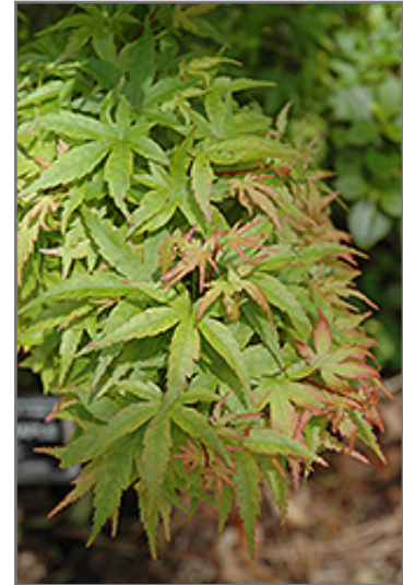
Sharp's Pygmy Japanese Maple foliage