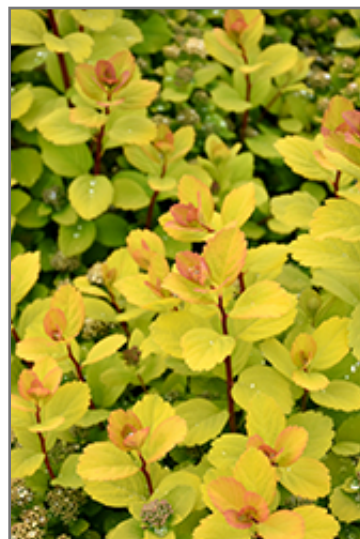
Glow Girl Birch Leaf Spirea foliage

This shrub should only be grown in full sunlight. It prefers to grow in average to moist conditions, and shouldn't be allowed to dry out. It may require supplemental watering during periods of drought or extended heat. It is not particular as to soil type or pH. It is highly tolerant of urban pollution and will even thrive in inner city environments. This is a selected variety of a species not originally from North America.