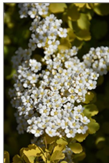
Glow Girl Birch Leaf Spirea flowers