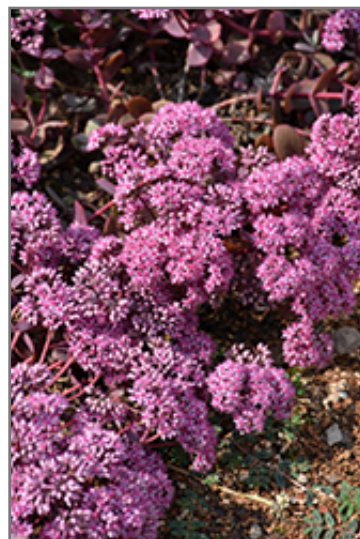
Cherry Tart Stonecrop flowers

Cherry Tart Stonecrop is a fine choice for the garden, but it is also a good selection for planting in outdoor pots and containers. It is often used as a 'filler' in the 'spiller-thriller-filler' container combination, providing a mass of flowers and foliage against which the larger thriller plants stand out. Note that when growing plants in outdoor containers and baskets, they may require more frequent waterings than they would in the yard or garden.