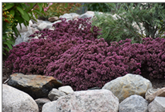
Cherry Tart Stonecrop in bloom

Cherry Tart Stonecrop is a dense herbaceous perennial with an upright spreading habit of growth. Its medium texture blends into the garden, but can always be balanced by a couple of finer or coarser plants for an effective composition.