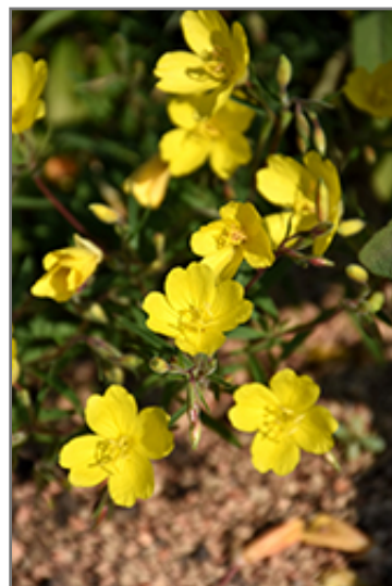
Lemon Drop Primrose flowers

Lemon Drop Primrose is recommended for the following landscape applications;