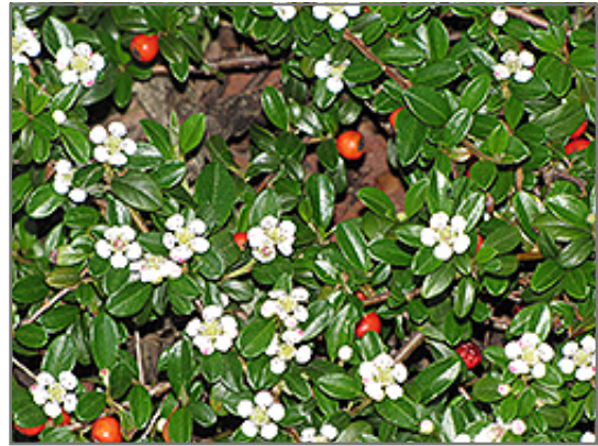
Coral Beauty Cotoneaster fruit

Coral Beauty Cotoneaster will grow to be about 12 inches tall at maturity, with a spread of 5 feet. It tends to fill out right to the ground and therefore doesn't necessarily require facer plants in front. It grows at a fast rate, and under ideal conditions can be expected to live for approximately 30 years.