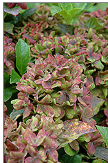
Pistachio Hydrangea flowers