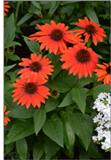
Sombrero Flamenco Orange Coneflower in bloom

Sombrero Flamenco Orange Coneflower is recommended for the following landscape applications;