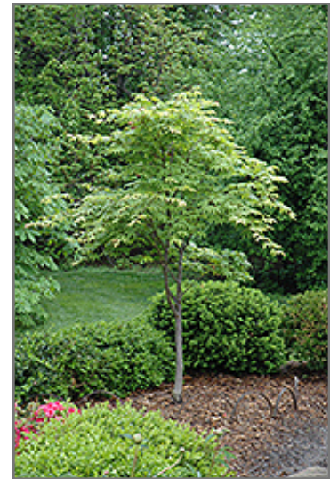
Osakazuki Japanese Maple