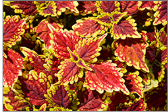
Oxford Street Coleus foliage