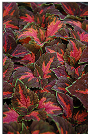
Superfine Rainbow Festive Dance Coleus foliage