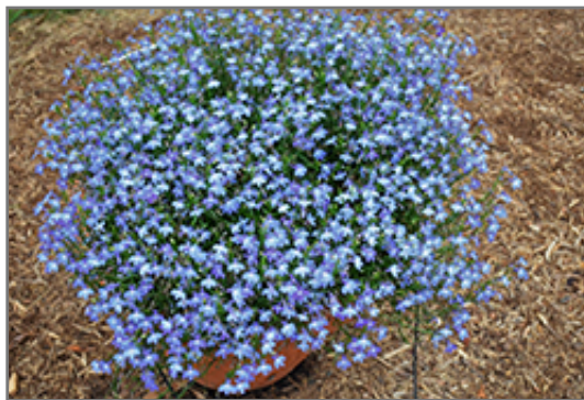
Bella Cielo Lobelia in bloom