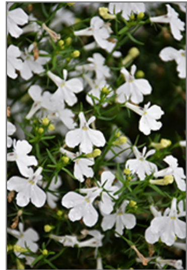
Bella Bianca Lobelia flowers