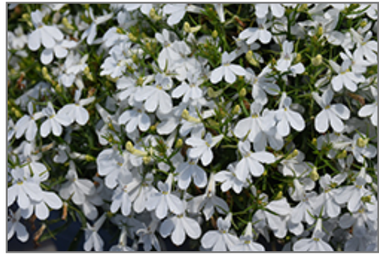
Techno Upright White Lobelia flowers

Techno Upright White Lobelia is recommended for the following landscape applications;