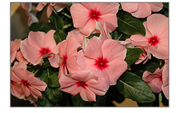
Vitesse Apricot Vinca flowers