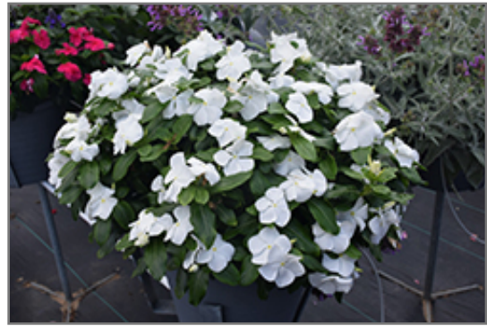
Titan Pure White Vinca in bloom

Titan Pure White Vinca will grow to be about 14 inches tall at maturity, with a spread of 12 inches. Its foliage tends to remain dense right to the ground, not requiring facer plants in front. Although it's not a true annual, this fast-growing plant can be expected to behave as an annual in our climate if left outdoors over the winter, usually needing replacement the following year. As such, gardeners should take into consideration that it will perform differently than it would in its native habitat.