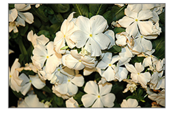
Cora White Vinca flowers

Cora White Vinca features showy white star-shaped flowers at the ends of the stems from late spring to mid fall. Its glossy oval leaves remain dark green in color throughout the year.