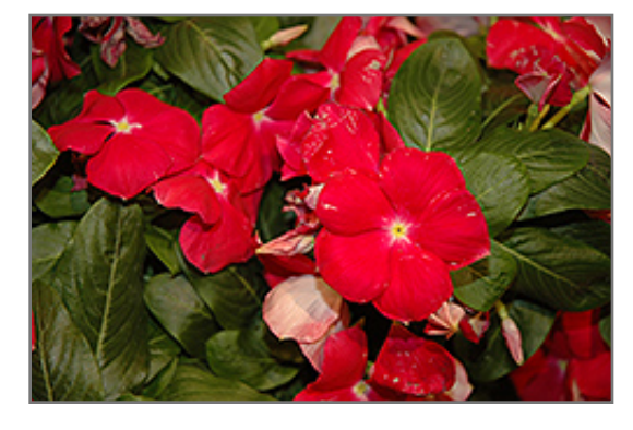
Cora Cascade Cherry Vinca flowers

Landscape Services & Design Center 1190 W. Moana Lane Reno, NV 89509 (775) 825-0602 ext. 134 NV Lic. #3379A, D & CA Lic. #317448