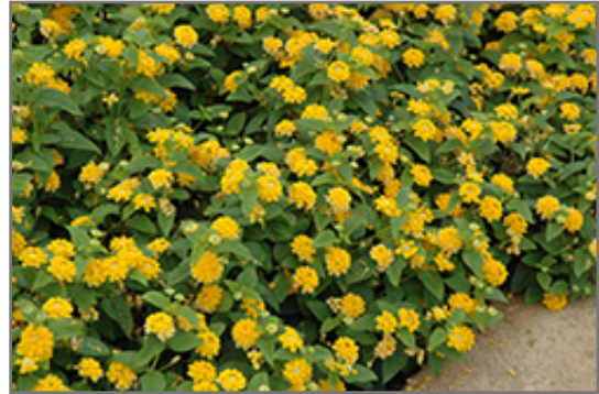
Little Lucky Pot Of Gold Lantana flowers