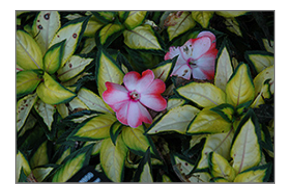
Strike Salmon New Guinea Impatiens flowers