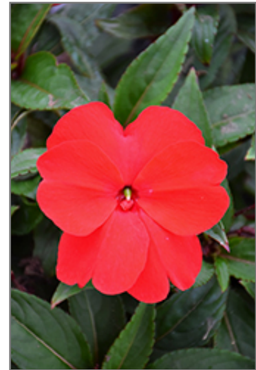
Florific Red New Guinea Impatiens flowers

Florific Red New Guinea Impatiens is recommended for the following landscape applications;