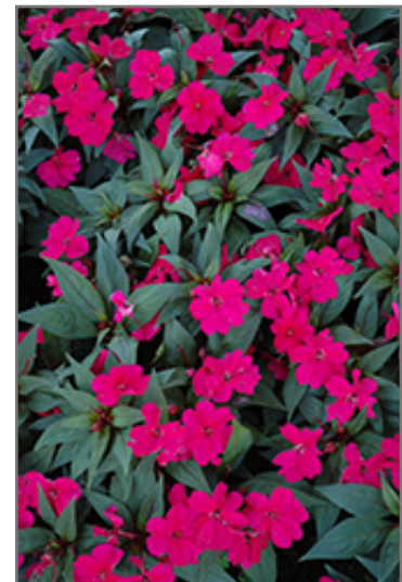
SunPatiens Compact Royal Magenta New Guinea Impatiens flowers