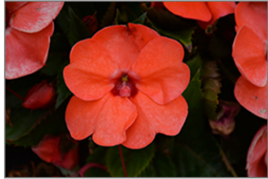
SunPatiens Compact Hot Coral New Guinea Impatiens flowers

This plant will require occasional maintenance and upkeep, and should not require much pruning, except when necessary, such as to remove dieback. It is a good choice for attracting bees and butterflies to your yard. It has no significant negative characteristics.