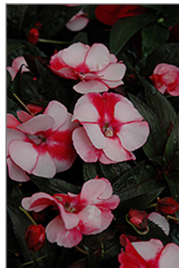
Sonic Sweet Cherry New Guinea Impatiens flowers