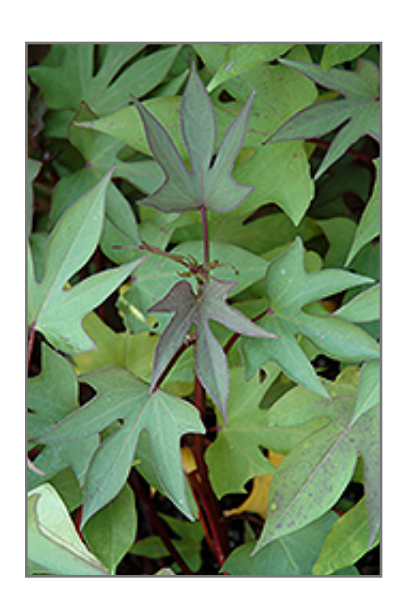
Desana Compact Red Sweet Potato Vine foliage

Desana Compact Red Sweet Potato Vine will grow to be about 18 inches tall at maturity, with a spread of 7 feet. Its foliage tends to remain dense right to the ground, not requiring facer plants in front. This fast-growing annual will normally live for one full growing season, needing replacement the following year.