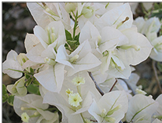
White Stripe Bougainvillea flowers