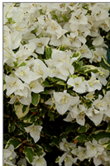
White Stripe Bougainvillea flowers