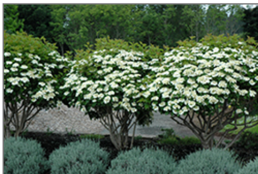
Compact European Cranberry in bloom

Compact European Cranberry is a dense multi-stemmed deciduous shrub with a more or less rounded form. Its average texture blends into the landscape, but can be balanced by one or two finer or coarser trees or shrubs for an effective composition.