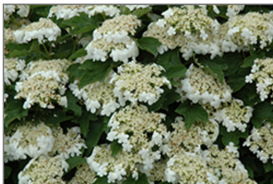
Compact European Cranberry flowers