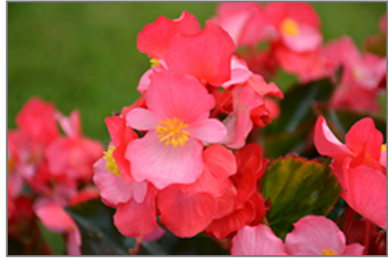
Surefire Rose Begonia flowers

Surefire Rose Begonia is an herbaceous annual with an upright spreading habit of growth. Its medium texture blends into the garden, but can always be balanced by a couple of finer or coarser plants for an effective composition.