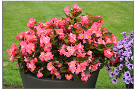
Surefire Rose Begonia in bloom