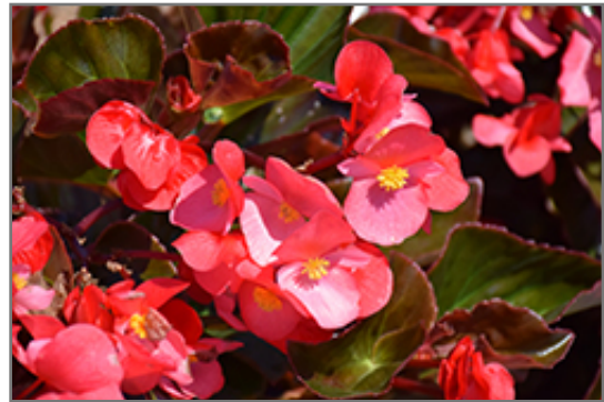
Whopper Rose Bronze Leaf Begonia flowers