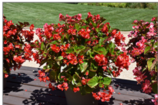
Whopper Red Green Leaf Begonia flowers