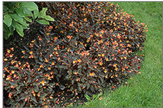
Sparks Will Fly Begonia in bloom

Moana Lane Garden Center & Corporate Office 1100 W. Moana Lane Reno, NV 89509 (775) 825-0600 (775) 825-0602 - Corporate Office